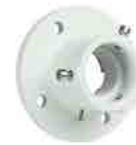
ALI-PTZCL PTZ Ceiling Mount Bracket